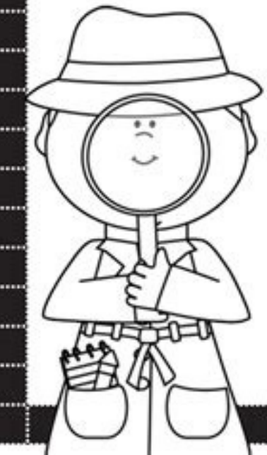
Reading genres worksheets. Fiction genres worksheet. Genre worksheet 3rd grade.